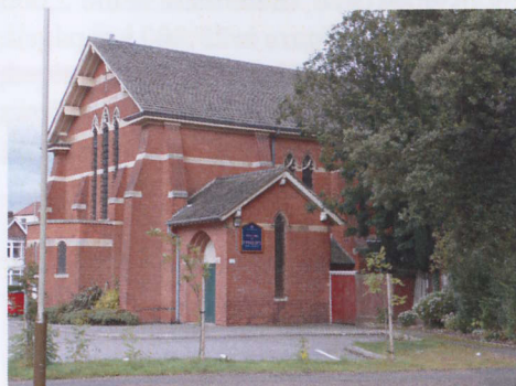
Church of St Philip, Stoughton Drive.

Many of you will know the Parish Church of St Philips in Stoughton Drive, Evington. It is now somewhat dwarfed by the splendid Masjid Umar mosque opposite. After a fire in 1996, the church was re ordered basically dividing the previous worship space into two. The eastern half is now the parish Church. The western half is a hall available for meetings, play groups and various activities. The other evening I saw the Leicester Philharmonic Orchestra practising Beethoven's Seventh Symphony in the hall.